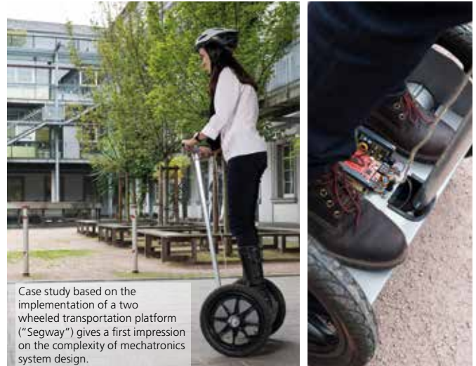
Case study based on the implementation of a two wheeled transportation platform ("Segway") gives a first impression on the complexity of mechatronics system design.

Finally implementation and integration leads to testing the overall system according to the early requirements. During the overall process of engineering, testing has been prepared and done in order to check the maturity level. Quality assurance has been executed in simulations and prototyping environments. At the end of those phases, the real system can be tested for the first time to finally check the user requirements in a hardware-in-the-loop environment or even in real test scenarios.